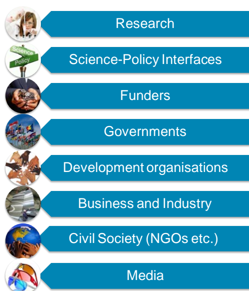
Figure 1: Main stakeholder groups relevant for Future Earth, globally and regionally

Future Earth will engage with and deliver essential knowledge to a wide variety of stakeholders across science, policy, business/industry and civil society communities to address global environmental change issues. These issues are many and strongly linked to human development challenges, and the solutions needed are multidimensional, cutting across scales, disciplines, sectors, in a system of interdependencies and interlinkages. Future Earth will support transformation towards global sustainability.